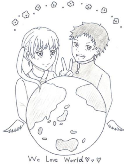
Illustration by a high school student from Brazil